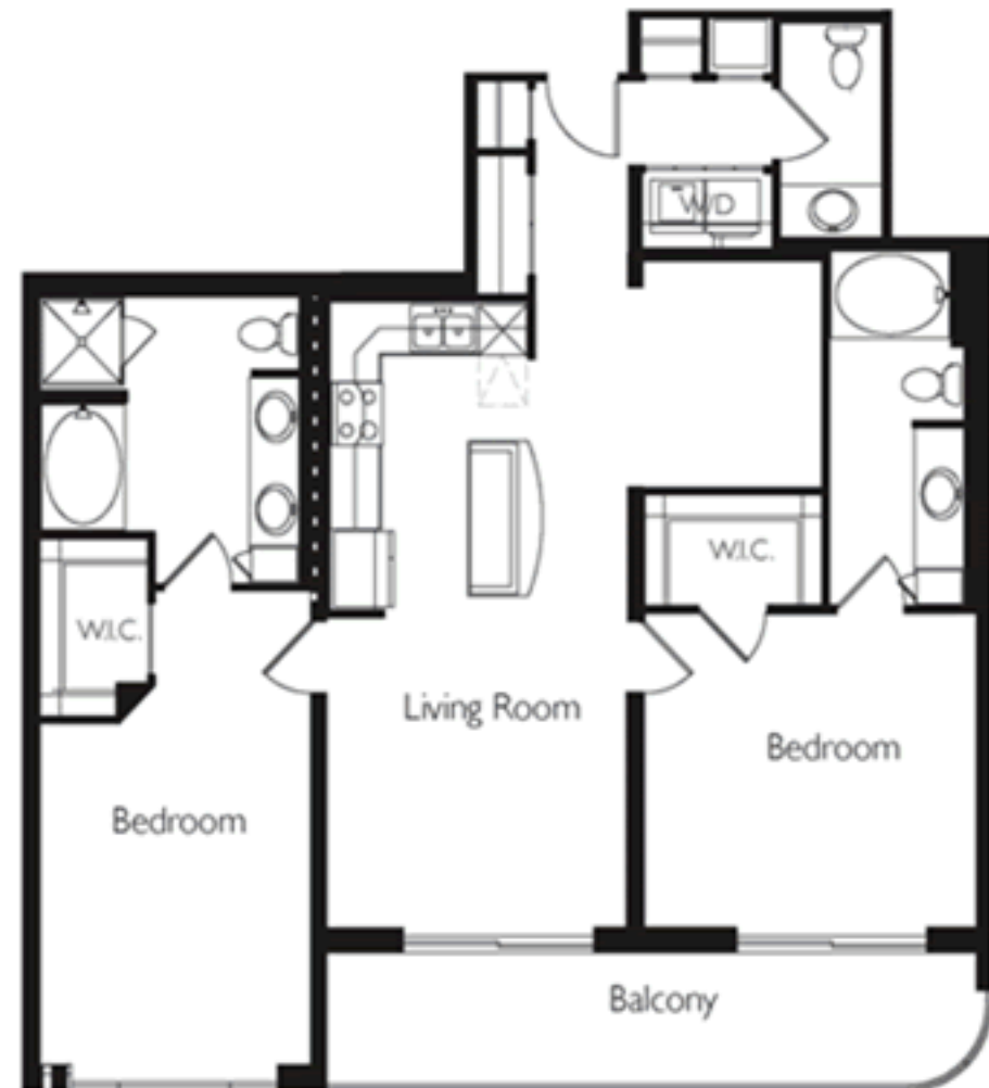
A Typical Two Bedroom Apartment